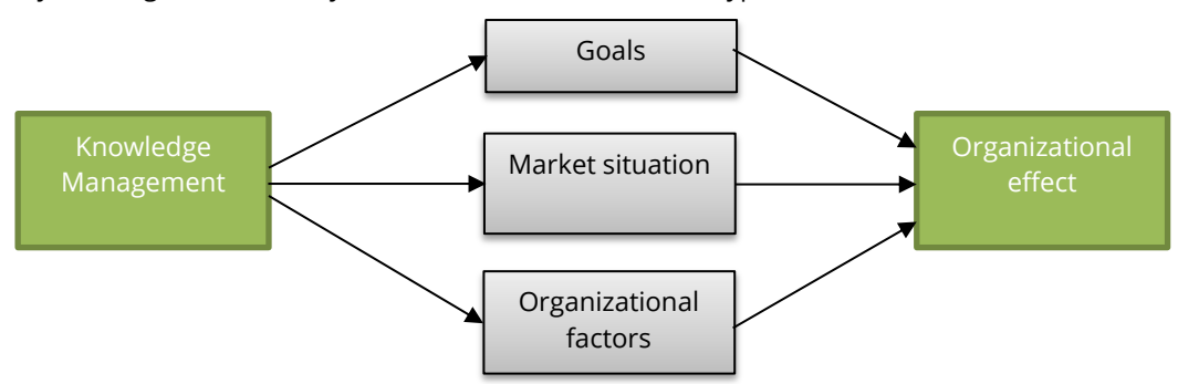
Fig 2. Relationship between Knowledge Management and Organizational Effect (Mohrman et al., 2001).

between the knowledge management, the organizational effect. Some of the research features are (Mohrman et al., 2001). The first research question: The research model is based on the three basic hypotheses.